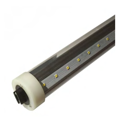
L \times D = 70'' \times 1.5''